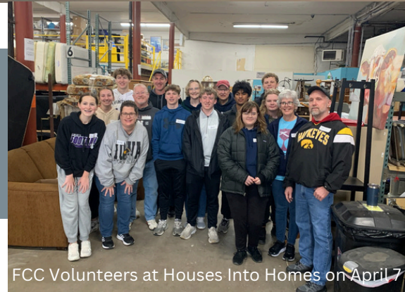
FCC Volunteers at Houses Into Homes on April 7

(319) 337-5400 olivia.colosimo@namijc.org namijc.org